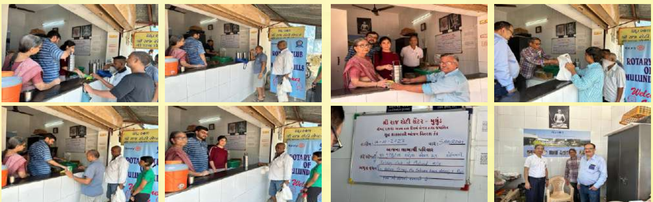
14-10-2023, Annadaan Project with Shri Raj Roti Centre at Jawahar Talkies Compound, Mulund W. 115 tiffins distributed