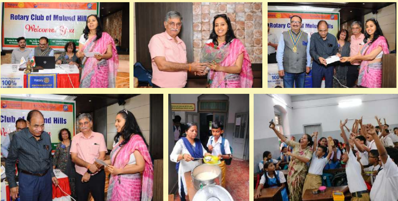
13-10-2023, Mid Day Meal Project with Annamitra Foundation. Club Contributed 147 students' mid day meal for 1 Academic year